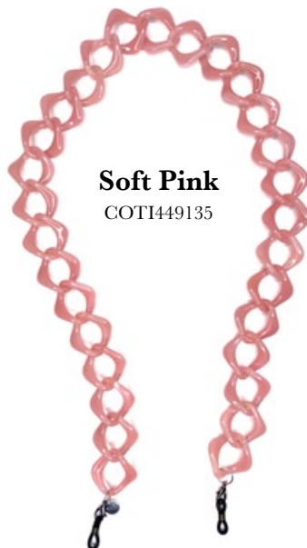
Soft Pink COTI449135