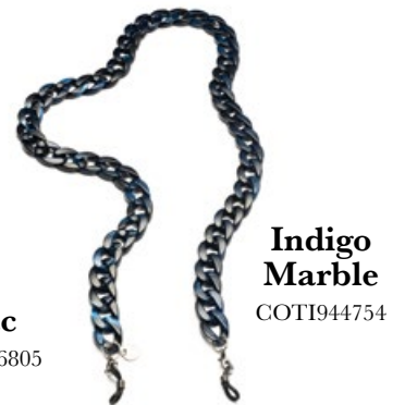
Indigo Marble COTI944754