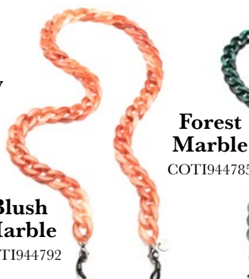
Blush Marble COTI944792