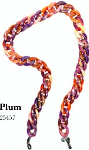
Spicy Plum COTI225457