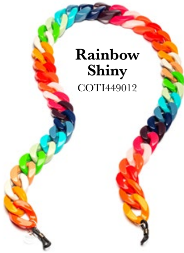
Rainbow Shiny COTI449012