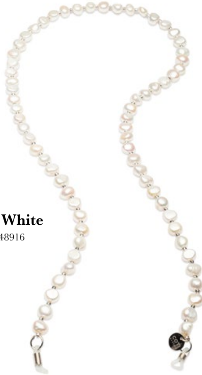
Classic White COTI448916

Hand strung high lustre baroque pearl glasses chains with faceted silver hermatite length 72cm / weight medium 55gm