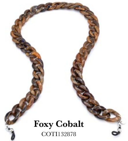
Foxy Cobalt COTI132878