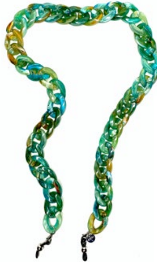
Stormy Water COTI117486