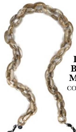
Light Brown Marble COTI985782