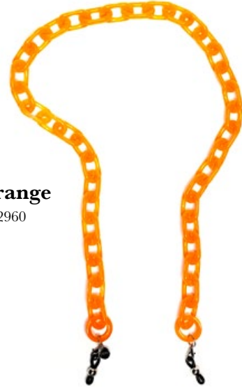
Neon Orange COTI132960