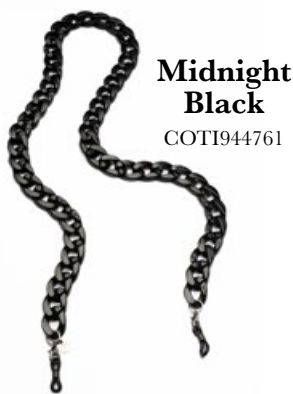
Midnight Black COTI944761