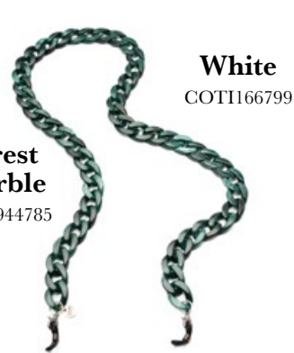
Forest Marble COTI944785