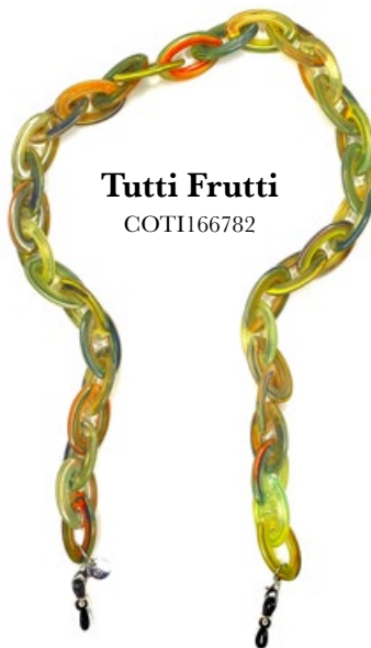
Tutti Frutti COTI166782