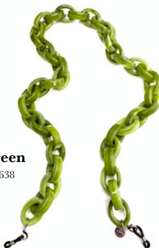
Fern Green COTI985638