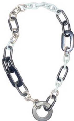
Shades of Grey COTI985805