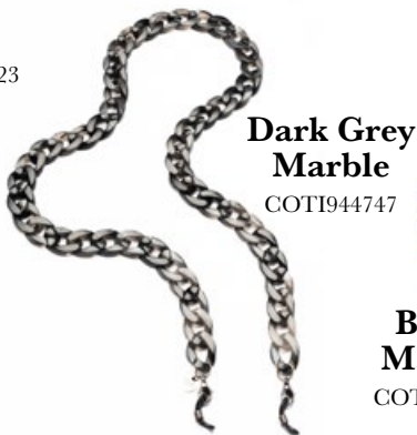
Dark Grey Marble COTI944747